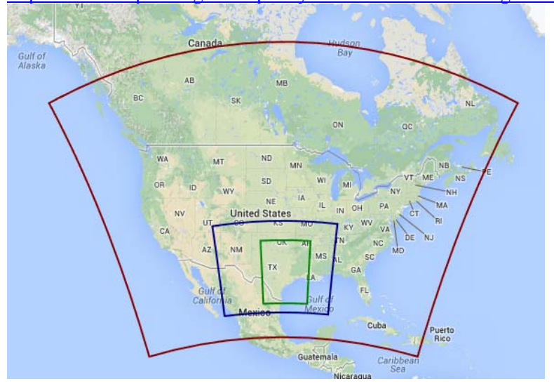
Figure 3. The analysis of soil moisture will be conducted for the 12-km (blue) grid domain.

Observation-based datasets are anticipated to include, but may not be limited, to the following: (1) the North American Land Data Assimilation System (NLDAS) and (2) root zone and surface soil moisture drought indicators from the Gravity Recovery and Climate Experiment (GRACE) Data Assimilation System (Houborg et al. 2012). Additional soil moisture data may be available from the Soil Climate Analysis Network (SCAN) and others that form the International Soil Moisture Network (ISMN).